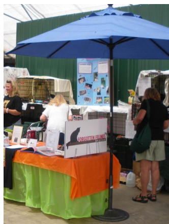
Tagawa Gardens adoption event

We continue to make progress towards our goal of improving the lives of Denver's homeless cats. Our 2012 contributions have been significant, but there are still so many, many more cats in the Denver area needing help. (See p. 4 for how you can help).