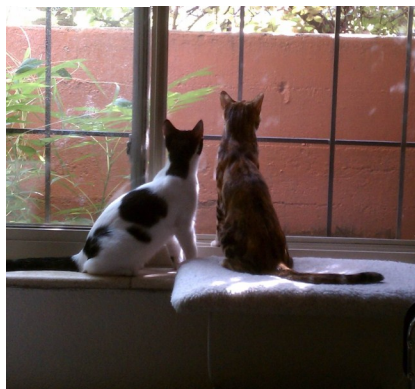
Bartok (L) & new best friend Maggie

"I thought you might like to see a picture of Bartok and Maggie. They are becoming fast friends and are enjoying watching the birds together. Bartok is just a joy. I think they are going to make good companions for each other.