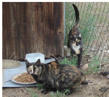
York St. cats enjoying their breakfast

As part of our TNR (trap/neuter/return) program, volunteers care for feral cat colonies throughout the Denver-metro area. TNR effectively addresses the extreme over-population of cats and improves the lives of the existing cats living on the street.