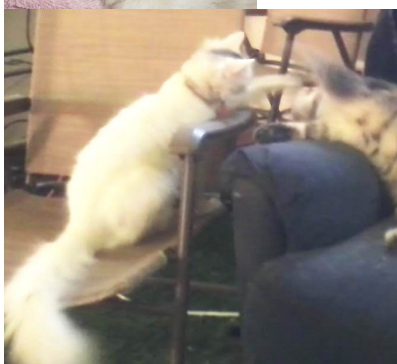
Bacall (L) & new best friend Danny

"We are still in love with Bacall. She is getting a tiny little belly from her spoiling lessons and likes to sleep right on top of me like I am Dinosaur Ridge. Her head marking is where she stores Danny's and my kisses. They sleep together and groom and play like two little rhinoceroses running through the house."